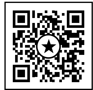
An example of a QR code.

There are many free QR code reader apps found in your device’s app store – for example, the Apple App Store for iOS, Google Play for Android, or Windows Phone Store for Windows Phone. To download an app, search “QR code reader” in the app store on your device and download.